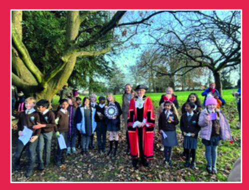
The Mayor and pupils with the Hinman Shield

They noted the work the colleges do to provide students and apprentices with programmes that enrich their learning including participating in meaningful trips and visits, accessing guest speakers from industry, gaining employability skills and much more. They are provided with opportunities to enhance their industry knowledge, acquire practical skills to