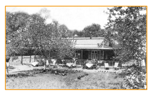
The original Orchard Bungalow

It started life as The Orchard Bungalow, a simple single storey structure built by Albert Cross in 1905. It was soon taken over by Mr and Mrs Raymont who marketed it very successfully as a tea garden to cater for the many day trippers coming out of inner London on the newly opened Metropolitan Railway extension from Harrow to Uxbridge. This extension and Ruislip Station opened in 1904 and soon established Ruislip and the neighbouring villages as popular locations for a day out in the country for those living in crowded inner London. Besides fresh air and countryside all these visitors needed refreshments and soon there were many establishments springing up to meet these needs