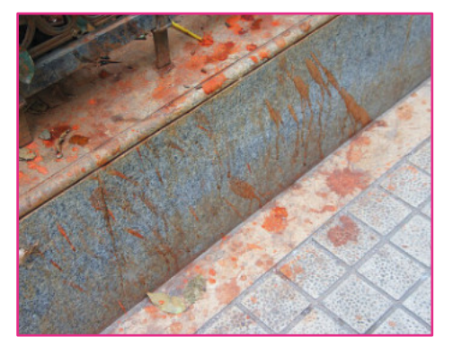
Staining caused by spitting Paan

is a foul habit that has no place on our high streets. I welcome that Ruislip councillors have requested for the area to be jetwashed, which has been escalated to the relevant cabinet member at the Council.