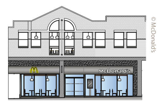
The proposed new McDonald's in Ruislip

www.ruislipresidents.org.uk/mcdonalds-plan-jan25/