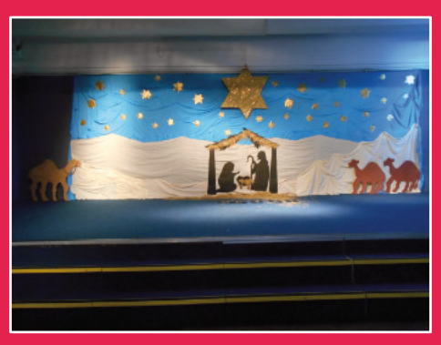
The backdrop of the show

During the past year the school held numerous events which included regular supportive coffee mornings for their families. All children from Nursery to Year 6 held Worries to Wellbeing workshops. They also marked special days or weeks such as Children's Mental Health Week with a variety of workshops.