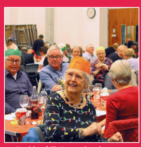
A table of Christmas lunch guests