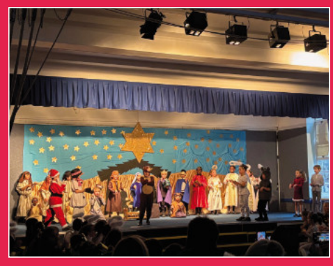
Some of the performers