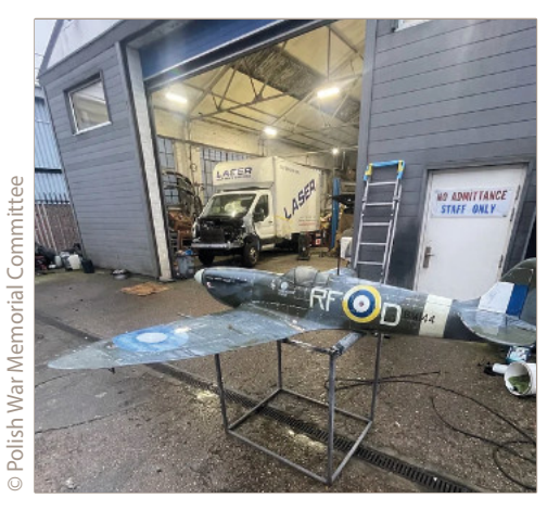
The Spitfire undergoing restoration

The Spitfire Memorial that was on the site has been temporarily moved by The Polish War Memorial Committee for refurbishment. The intricate and detailed restoration is expected to take several months and as it is a locally listed monument it is expected to be returned to The Orchard in due course. The RRA will keep you notified of any developments. You can find more details on our website at: