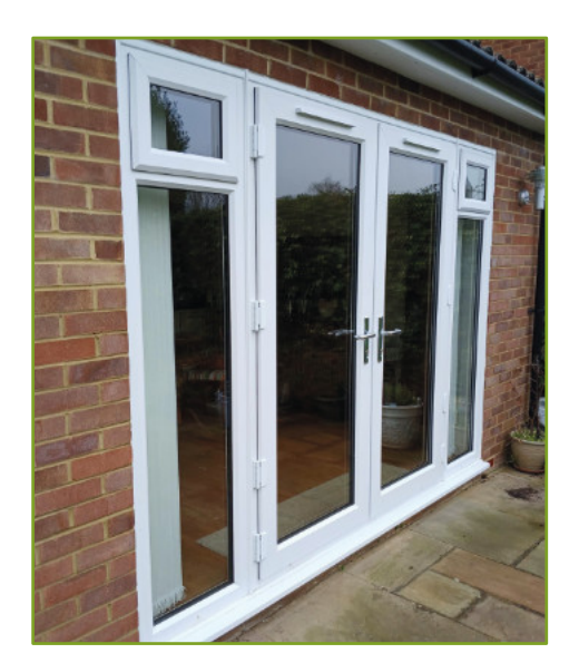
A flood-resistant patio door, designed to withstand 600mm of water