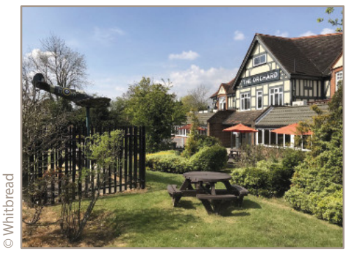
The Orchard in better days

The Orchard - In November 2024 Lidl conducted an exhibition at Ruislip Conservative Club to obtain local feedback regarding potential proposals to build a supermarket on the site of The Orchard in Ickenham Road.